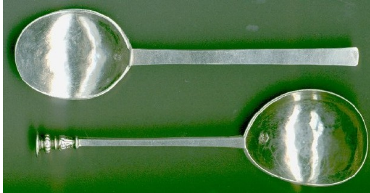
Figure 4: Puritan and Fig-shaped Bowls.

NB: Distinguishing between Egg- and Fig-shaped bowls can be confusing. For Egg-shaped bowl the handle attachment is at the wide end of the bowl, whereas Fig shaped bowls are attached at the narrow end.