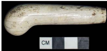
Figure 5: Pistol Grip