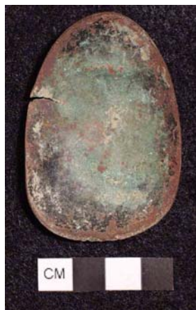
Figure 3: Egg-shaped Bowl