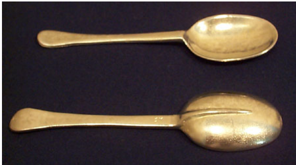
Figure 1: Rat Tail Spoon

A Spoon Rat Tail is a metal “spinal rib” on the back of a spoon bowl that reinforced the connection between the bowl and the stem (Figure 1). Seen in silver and latten spoons, the rat tail is most often associated with an egg-shaped bowl. The single or double metal “scale” at the junction of the bowl and the stem replaced the rat tail by the 1740s. (See Hume 1991:181-183.)