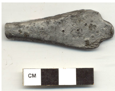
Figure 6: Trifid