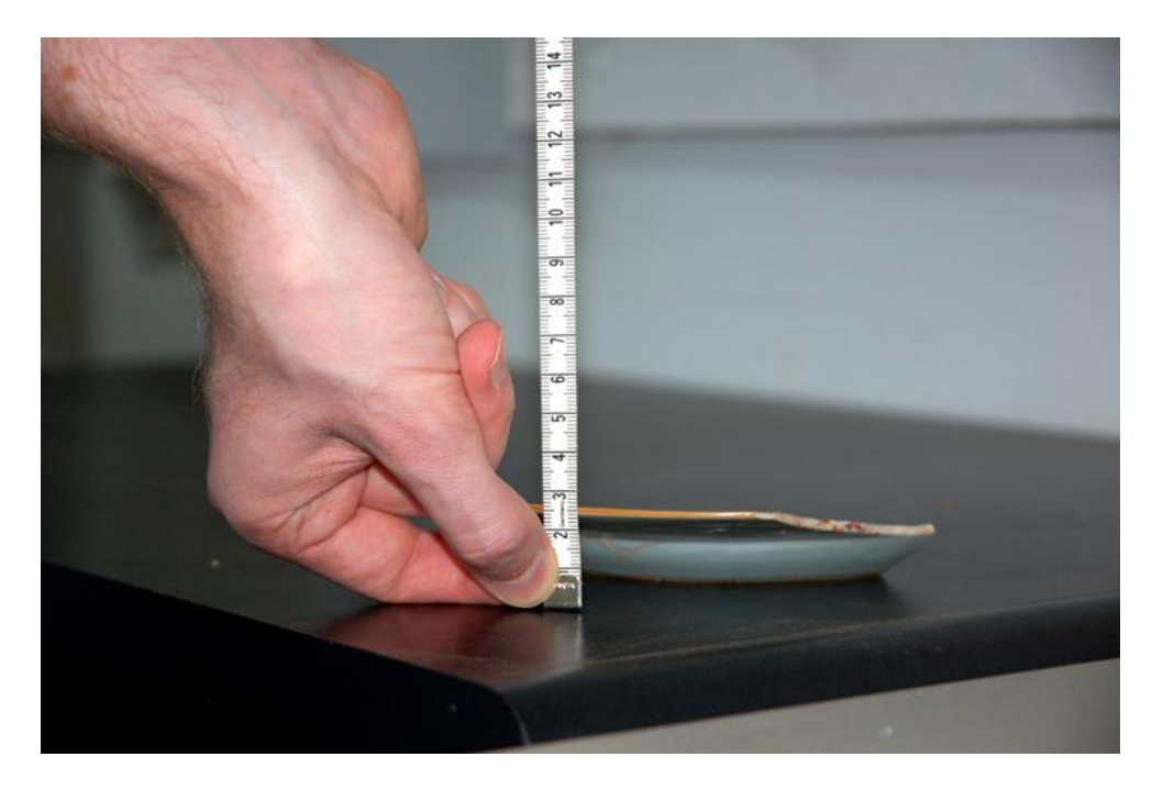
Object Height Measurement