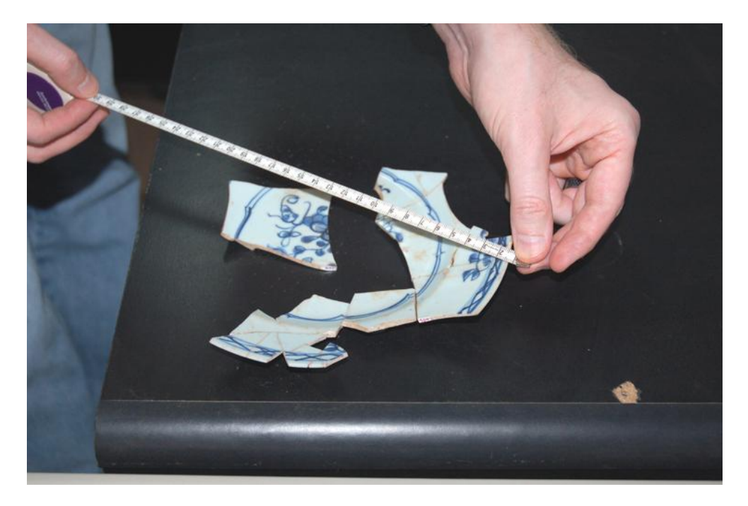
Exhibit Height Measurement

The fields Exhibit Length , Exhibit Width , and Exhibit Height , as described below, provide a place to record measurements that indicate the amount of space needed to accommodate the object within an exhibit case. For complete objects that do not include multiple, unmended pieces, these measurements will be identical; to Object Length, Width and Height. However, some objects contain several groups of mended artifacts. If, for example, you have three groups of mended ceramic sherds that belong to the same plate but the groups are not mended to each other, you would arrange those three groups of mended sherds so that they relate to each other in the best possible manner. Then you would measure the length, width, and height of that arrangement.