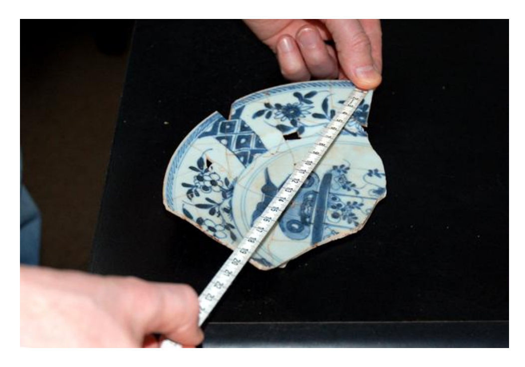
Object Length Measurement