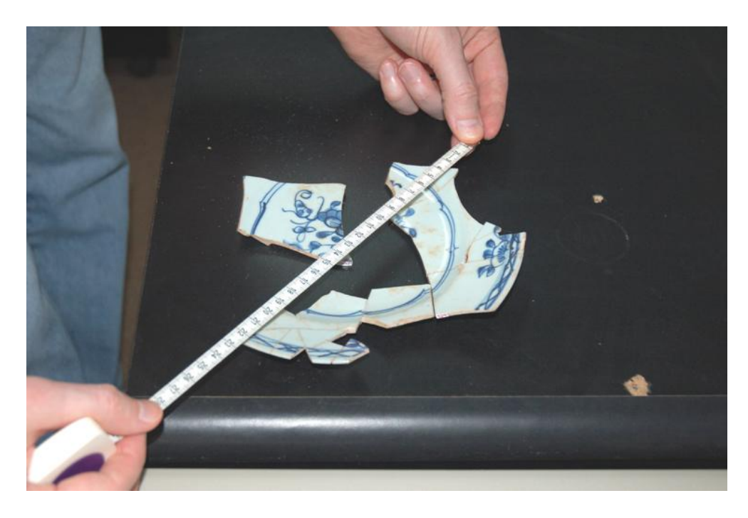
Exhibit Width Measurement